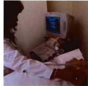
Carotid artery ultrasound, used with NASA software, detects hardening of the arteries.

JPL's Image Processing Laboratory was created in 1966 to receive and make sense of spacecraft imagery. In the lab, the NASA-invented Video Imaging Communication and Retrieval software has been used to process pictures from numerous space missions, including the Voyagers and Mars Reconnaissance Orbiter. Periodic upgrades of the imaging software have enabled greater accuracy and improved knowledge of our solar system, and have laid the groundwork for understanding images of all kinds.